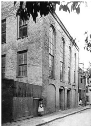
The African Meeting House in Boston, circa 1885 [ENLARGE]